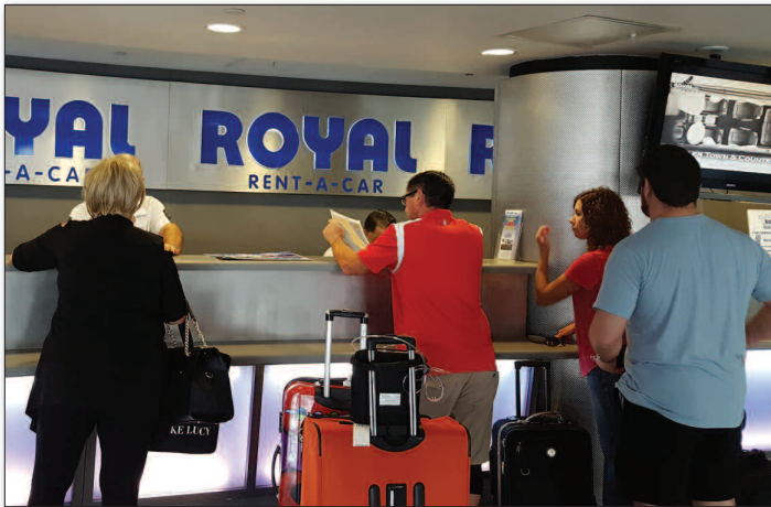
Busy counter at the Fort Lauderdale location.