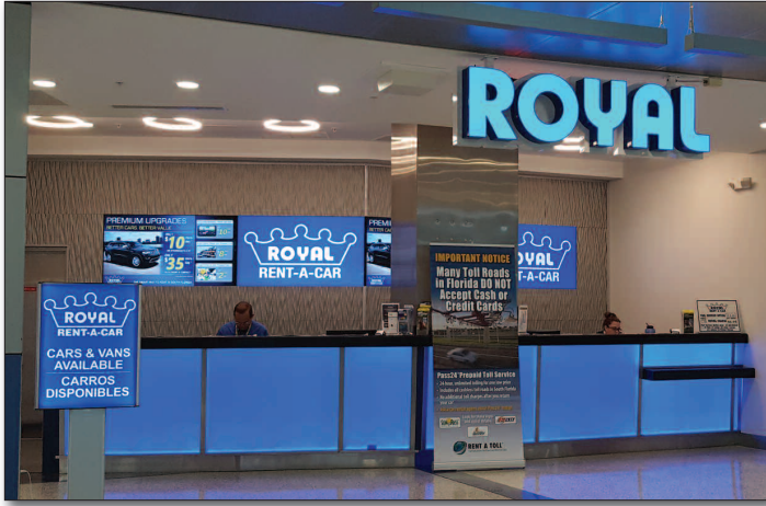
The Miami location.

Based in Miami, Royal Rent A Car of Florida has been using Bluebird software since 1996. They operate in-terminal counters at the Miami and Fort Lauderdale airports.